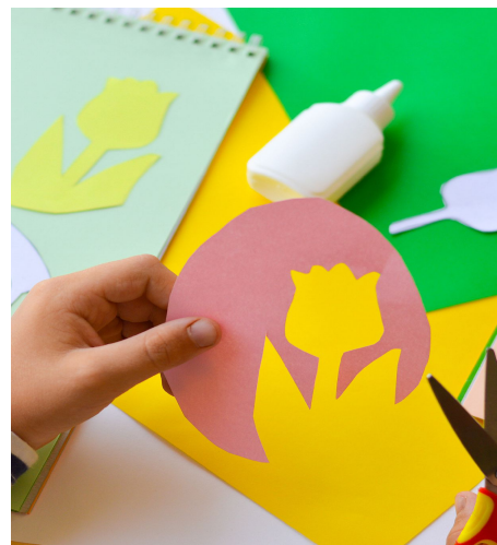
Organization sharp craft