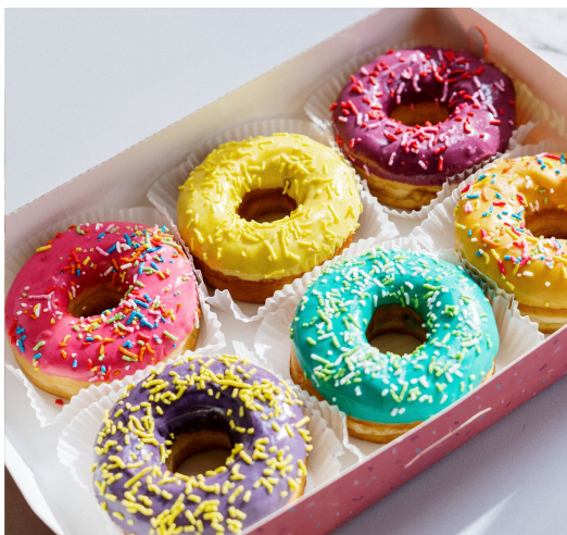
Clay donut network flag