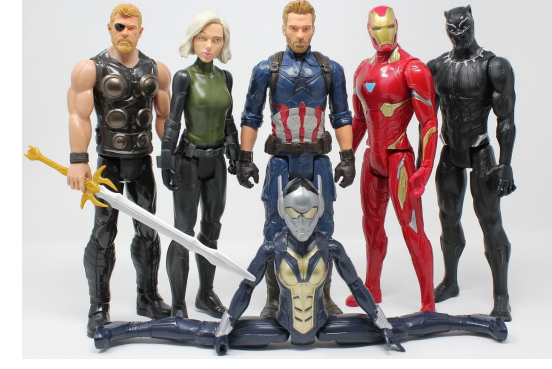
Mythology/Movie Character - Personal Brand